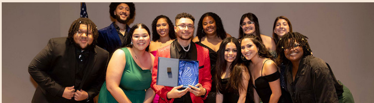
Photo of 2023 Multicultural Gala

The Diversity and Inclusion Innovation Grant (DIIG) Program, which supports projects that advance justice, equity, diversity, inclusion, and/or belonging in various areas, such as recruitment and retention, inclusive pedagogy, dialogue and civil discourse, social justice, and workplace inclusion.