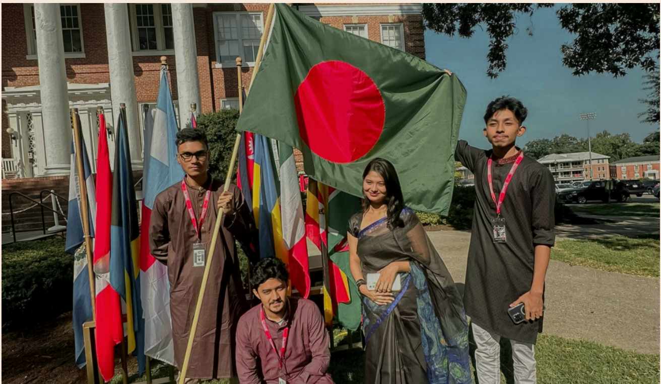
Photo of International Students from Bangladesh

The year 2023 was a remarkable one for the University of Lynchburg in terms of cultural diversity. Despite the challenges and uncertainties posed by the global pandemic, social movements, and political changes, the University welcomed a record number of international students, organized and participated in various events and programs that celebrated and promoted diversity, equity, inclusion, and belonging, and demonstrated its commitment to becoming a more inclusive and global community.