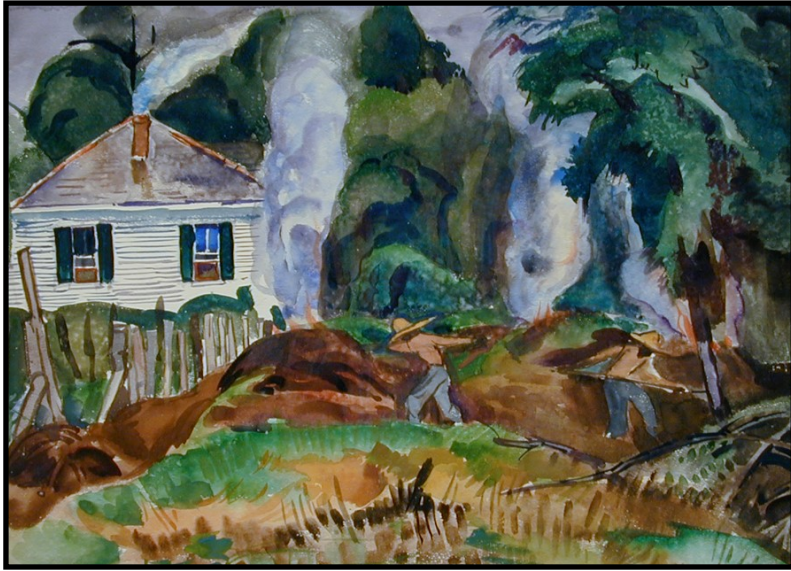
Pierre Daura, Burning Brush , (detail), watercolor on paper, ca. 1945-70